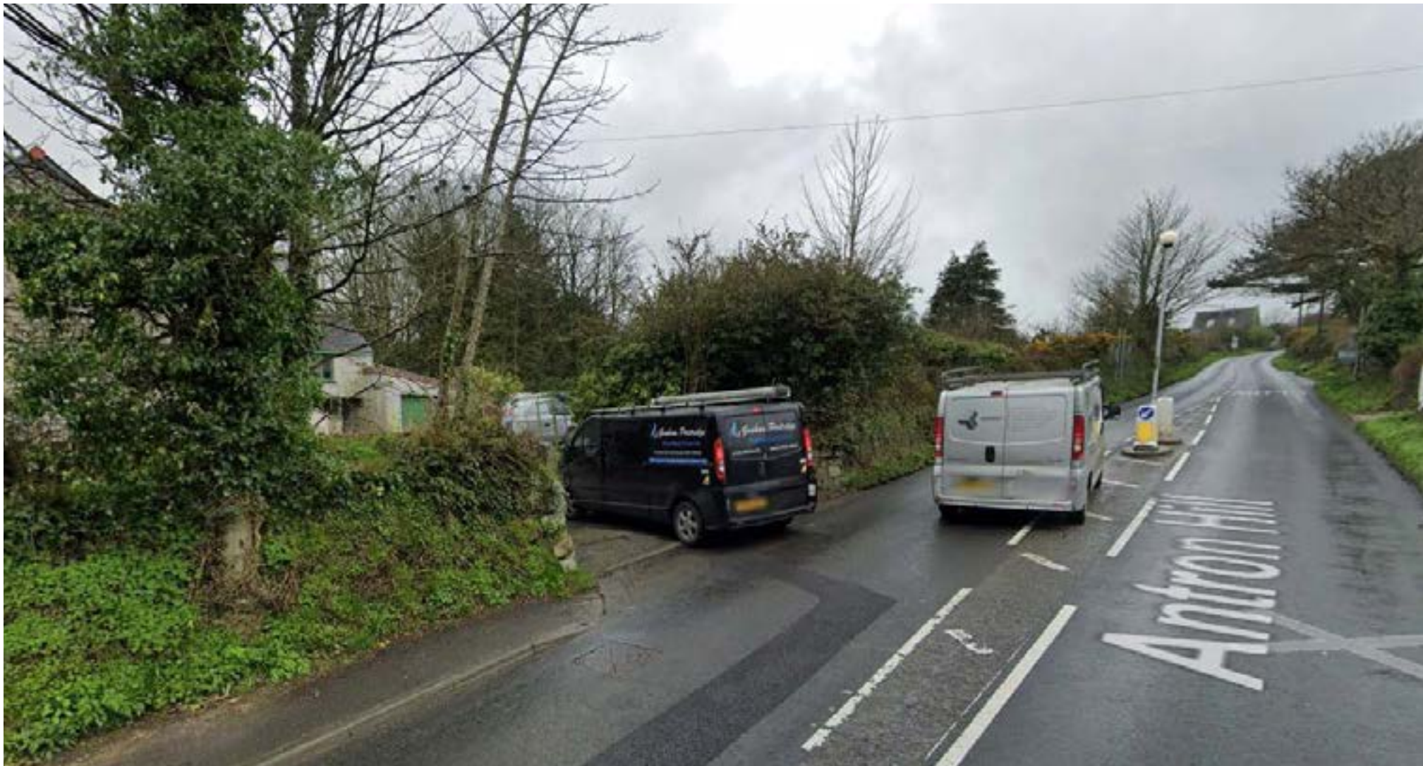
6) Antron Hill looking West; Existing footpath from Village stops – continuation or safe connection required