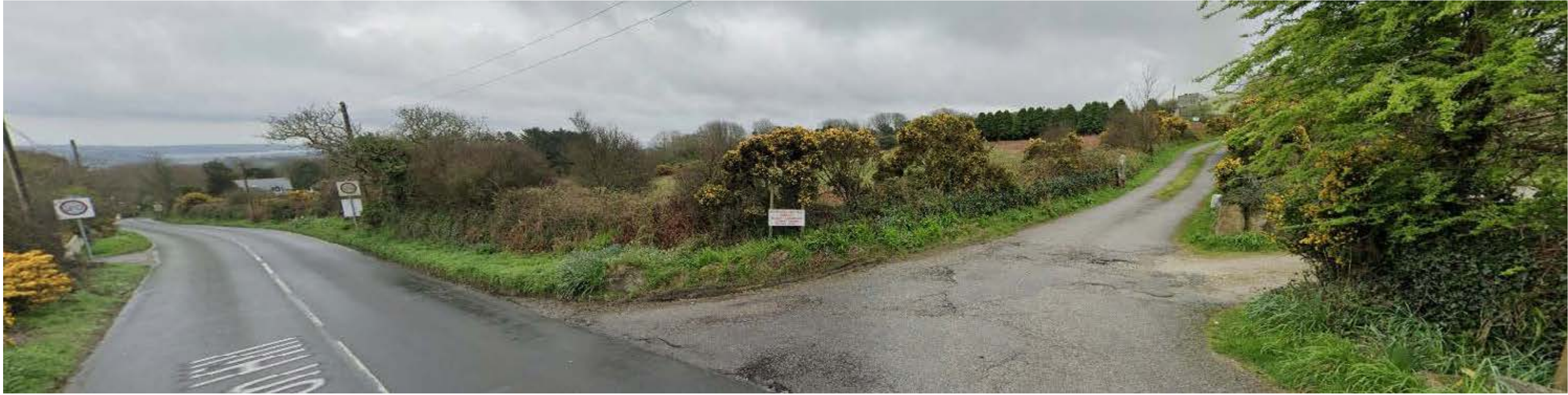
4) Quarry Lane & Antron Hill Junction; Speed restrictions, poor visibility to junction and overhead wires to review in design.