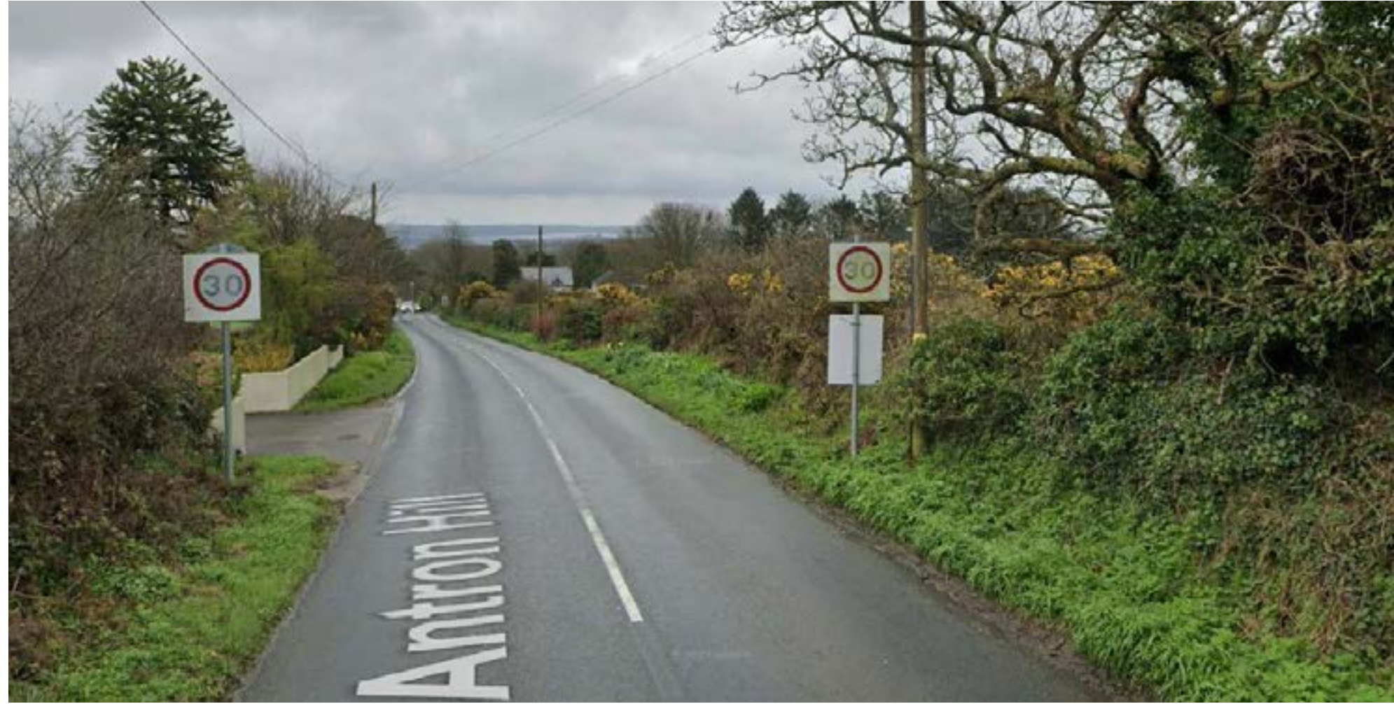
3) Antron Hill Looking East; High Cornish Hedgebanks and speed restrictions in place.