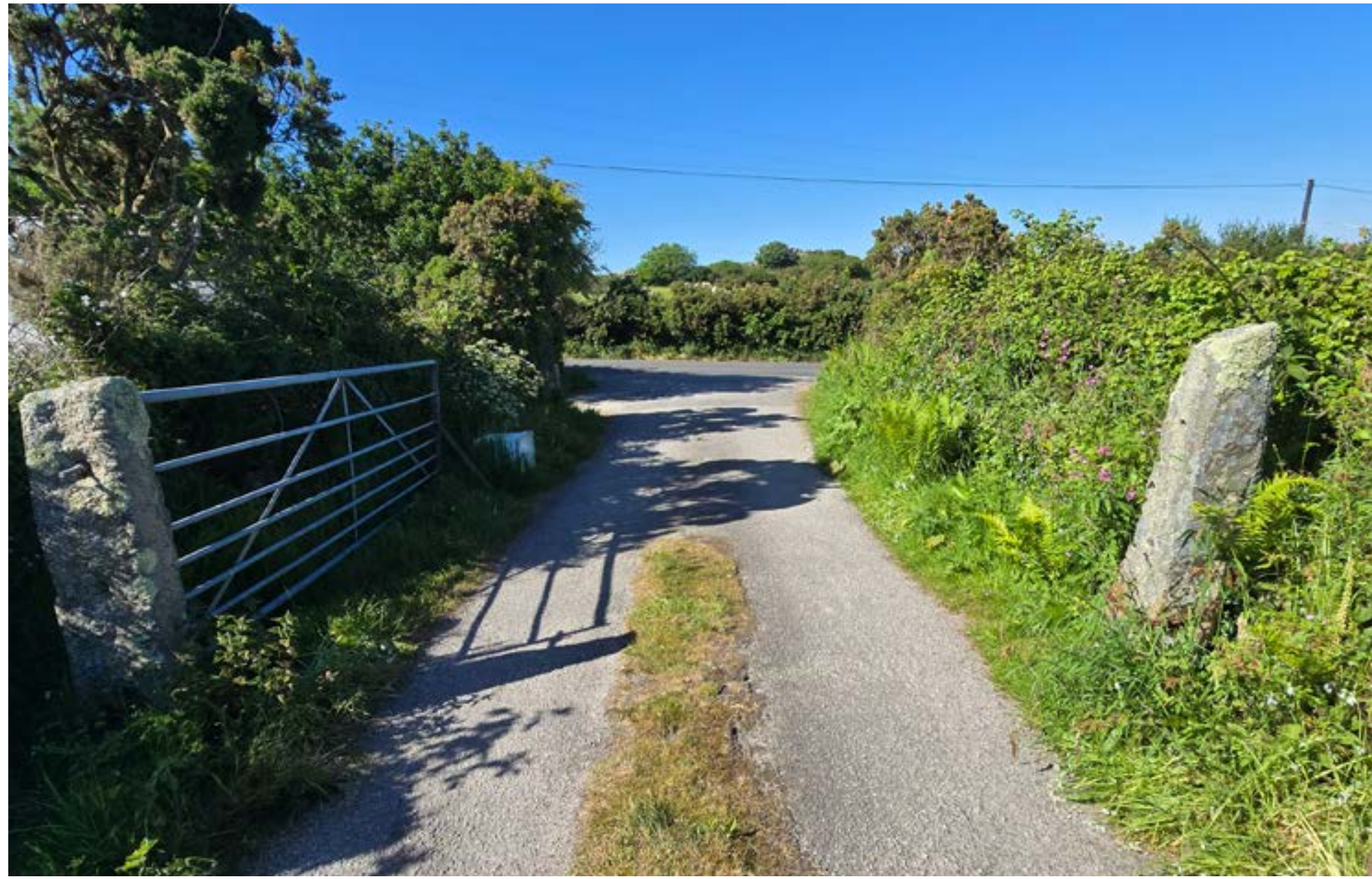
1) Quarry Lane looking North to Antron Hill; Poor visibility from the junction, with the lane also being used by quarry lorries. The lane is also a designated Public Right of Way, path 217/17/1.