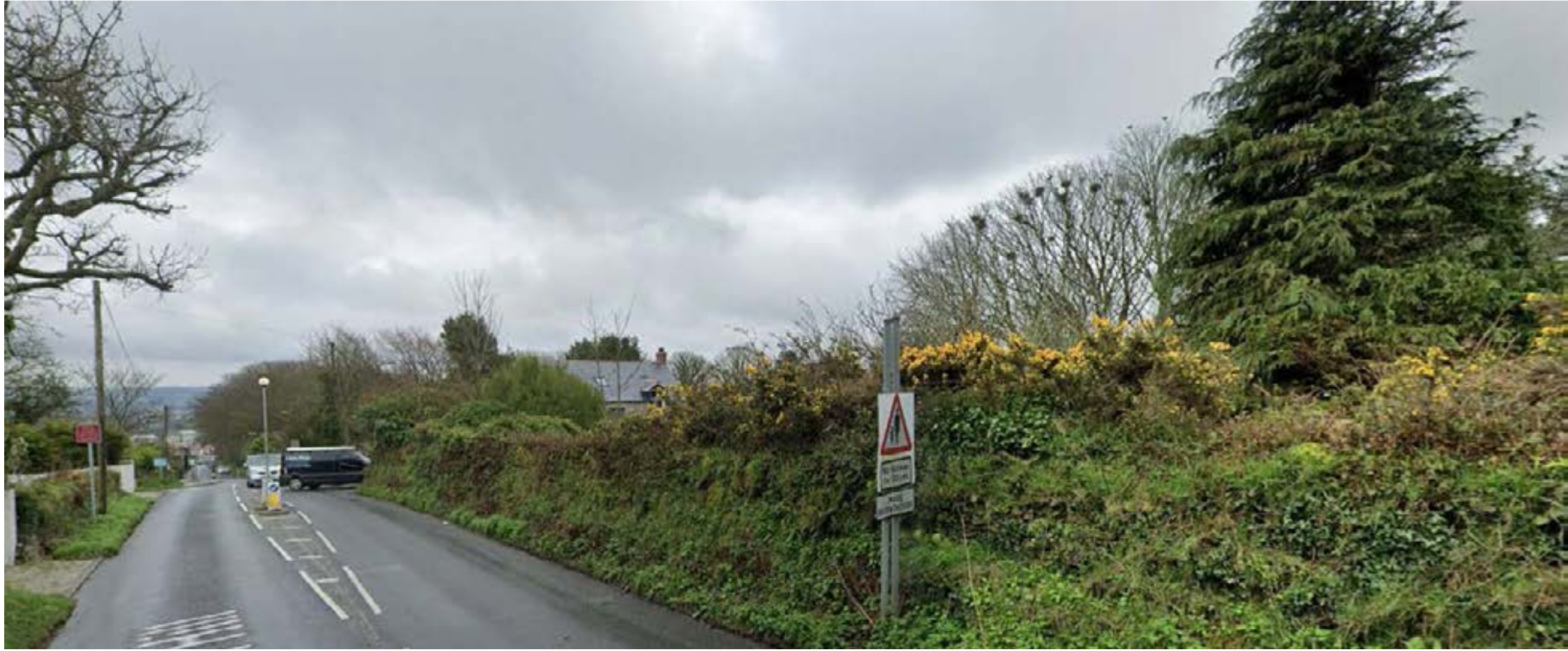
5) Antron Hill looking East; No footpath requires people to walk in road which is unsafe – safer connections to be reviewed as part of designs.