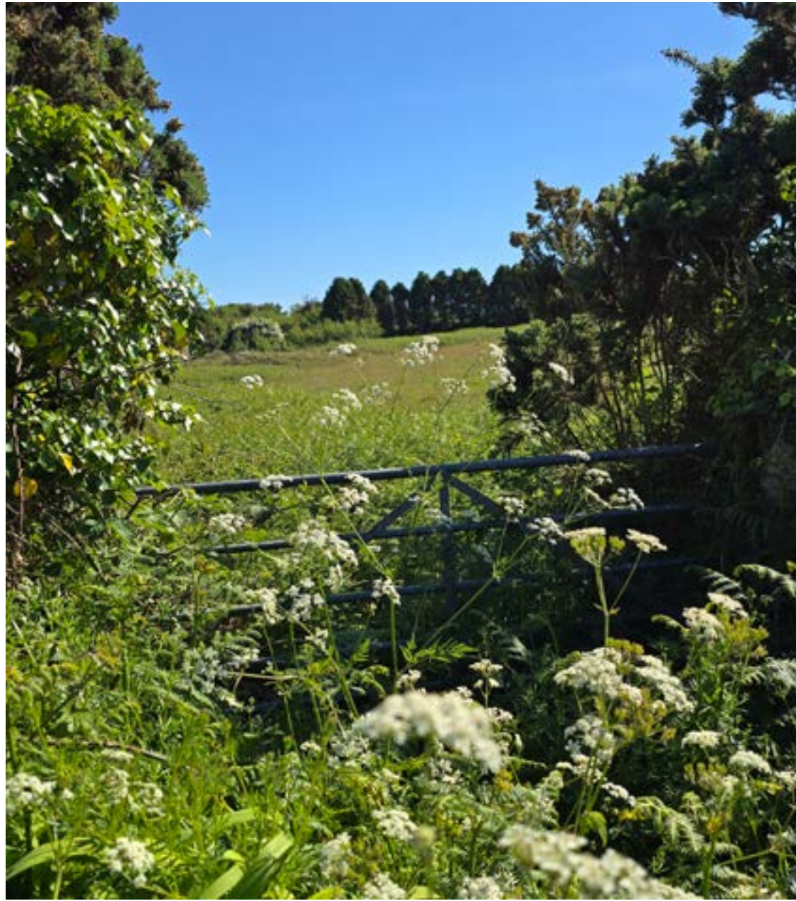
2) Existing entrance; Existing field gated entrance along Antron Hill, currently overgrown.