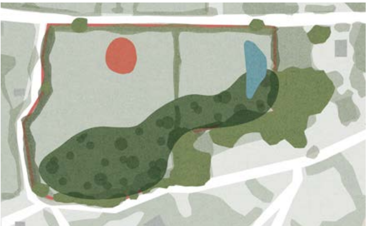
Option 1 a single structure forming the focal entrance point